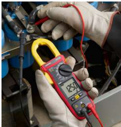
AMP-320 AC/DC Clamp Meter Electrical Motor Maintenance