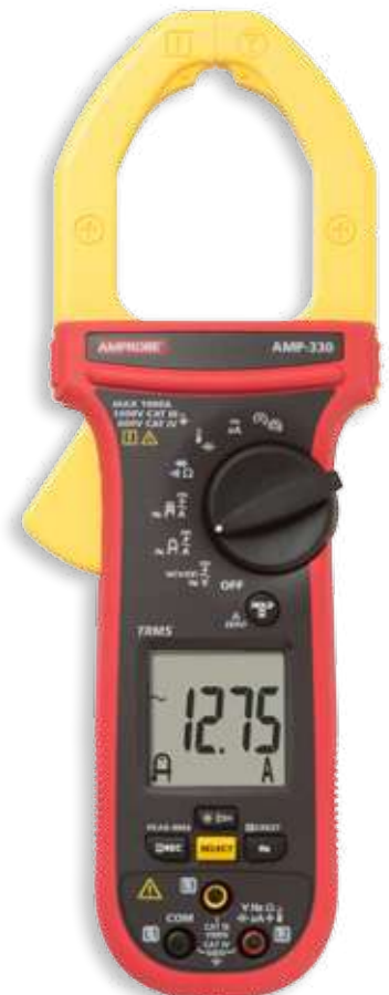
AMP-330 AC/DC 1000 A Clamp Meter Industrial Motor Maintenance